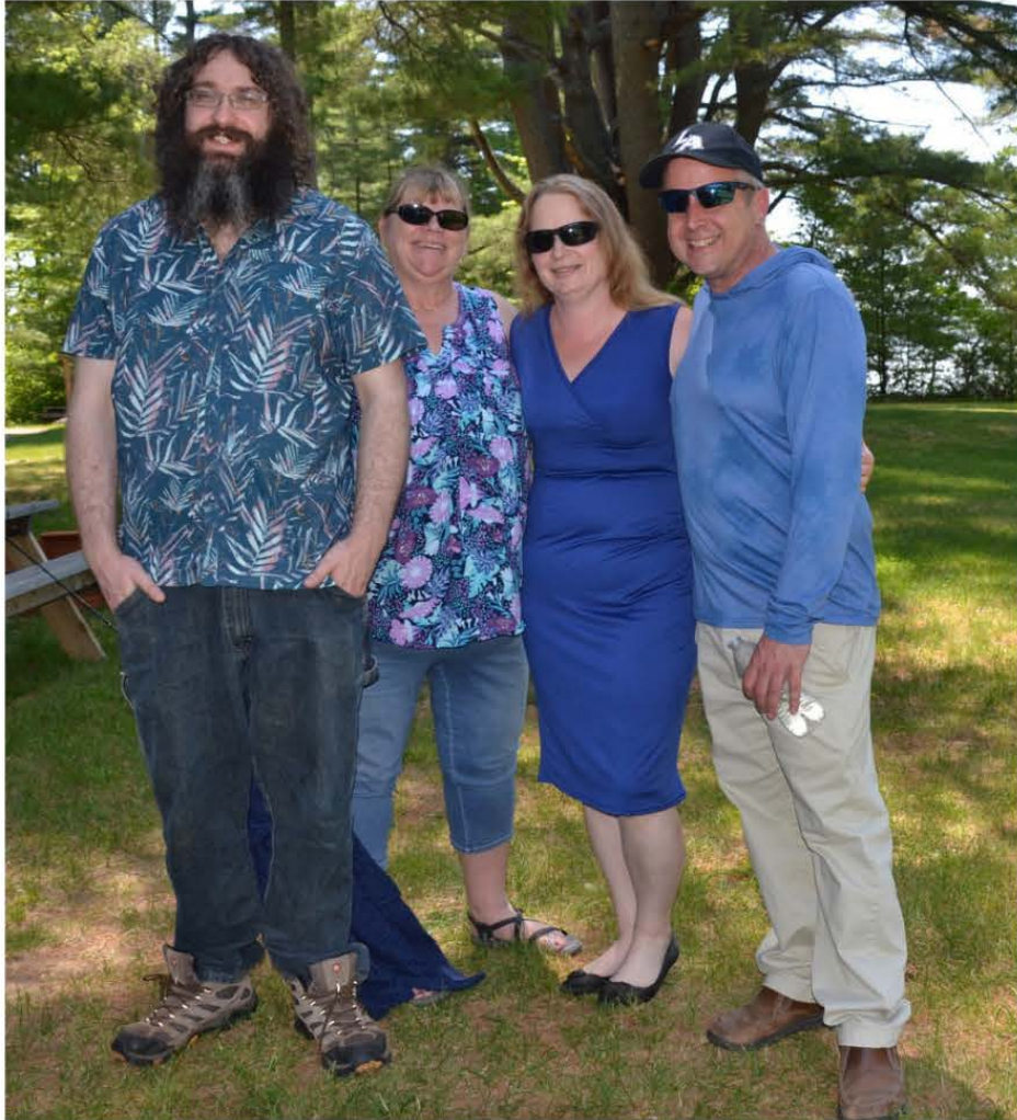
Managers enjoying Wavus

A special thank you to Camden National Bank for sponsoring our Annual Meeting