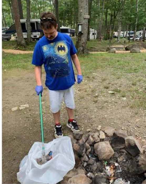
Lake Pemaquid Campground